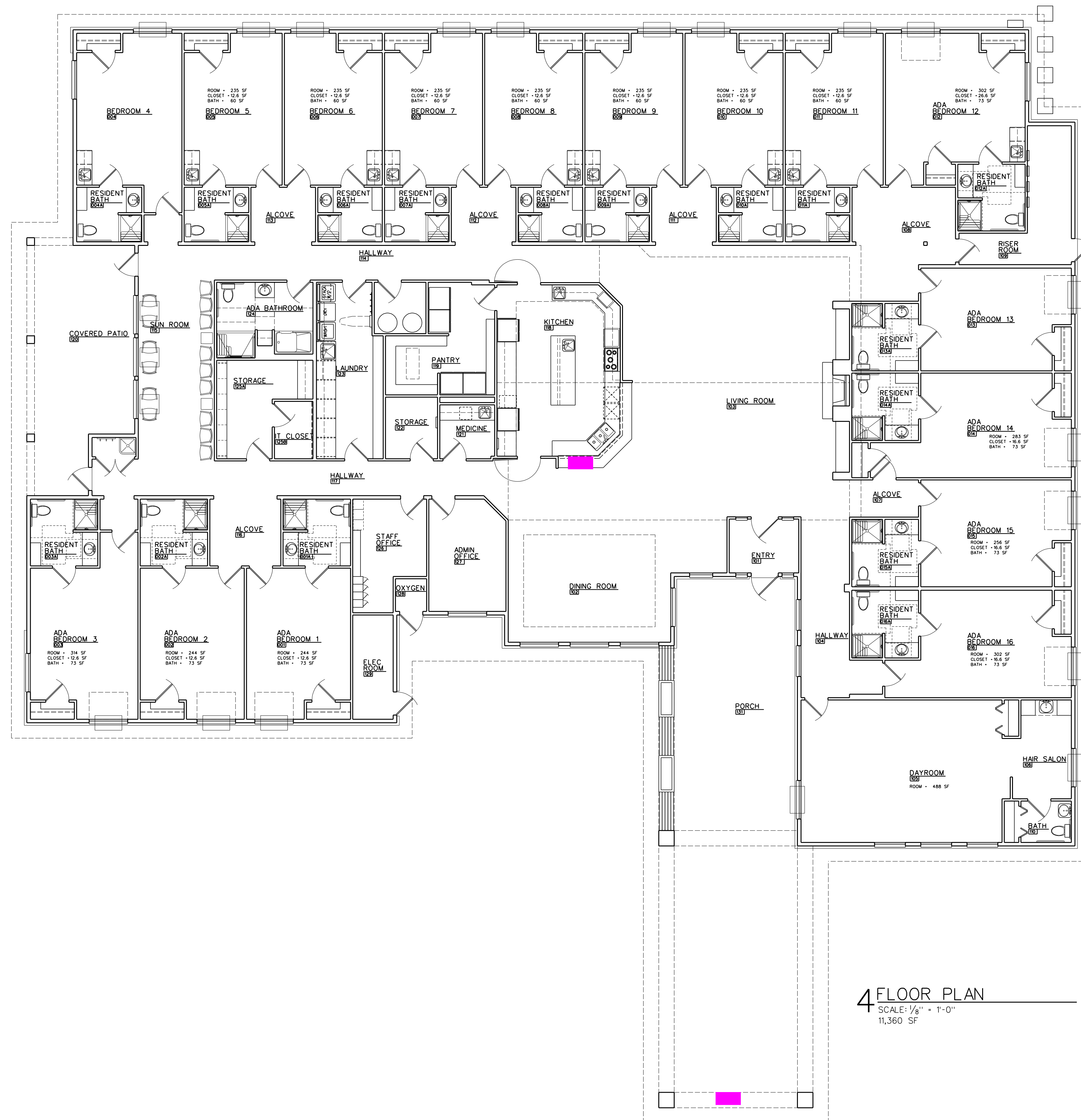
4 FLOOR PLAN SCALE: 1/8" = 1'-0" 11,360 SF

LICENSED ARCHITECT APR-15/296 Jason W. Tomlinson DATE: 6/25/2013 JASON W. TOMLINSON STATE OF IDAHO